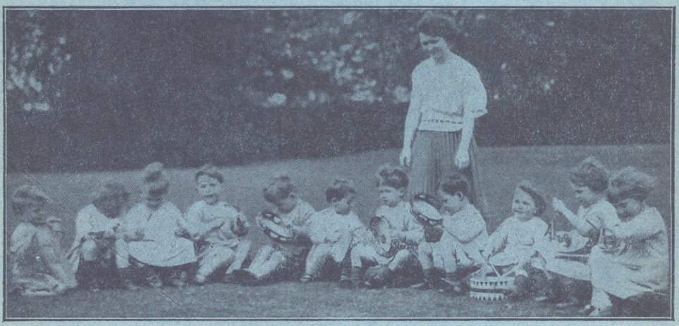
There is nothing the blind babies at the "Sunshine Homes" of the National Institute enjoy so much as their "Jazz Band." The orchestra plays under ideal conditions. H.R.H. Princess Beatrice is the President of the Homes.

ACTIVITIES OF THE NATIONAL INSTITUTE FOR THE BLIND,—I. BLIND BABIES' HOME