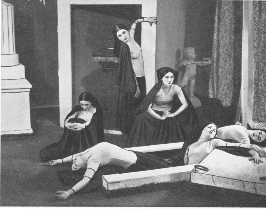
"The Dance of the Dead Spanish Dancers," Produced at the Osrobozene Theatre (Prague)