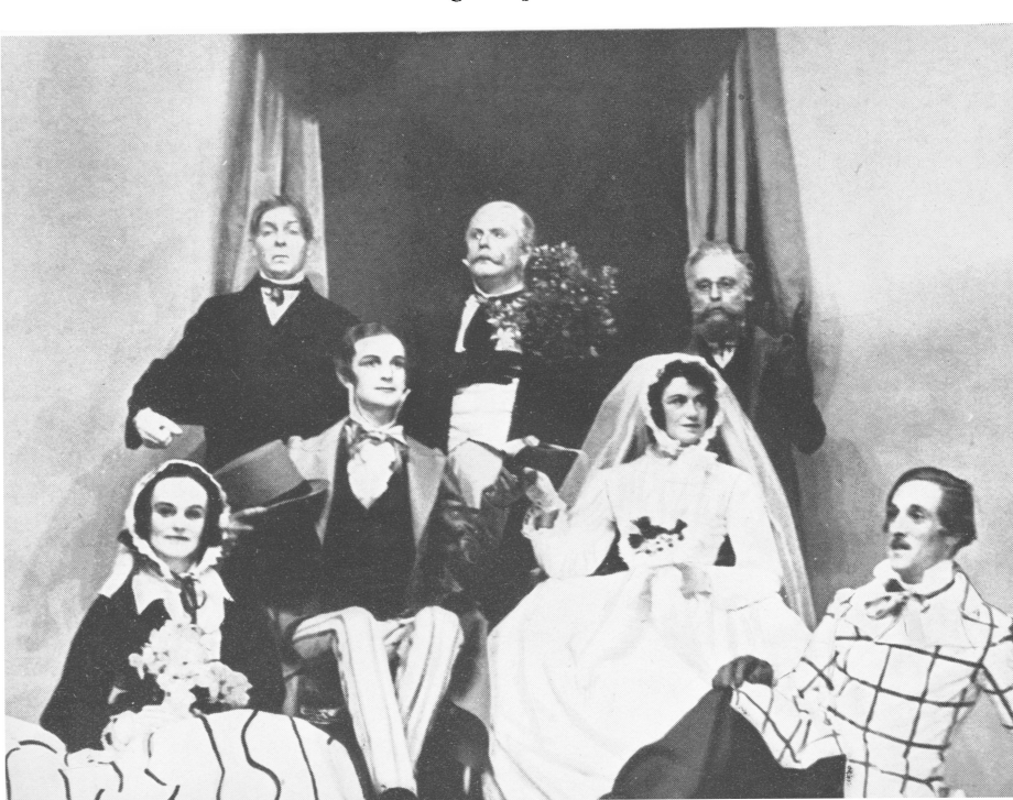
"An Italian Straw Hat." The Wedding Group: Dublin Gate Theatre (Longford Productions